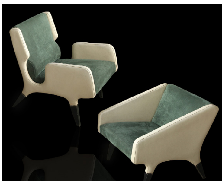
Gio Ponti chairs from the Parco de Principe Hotel, Italy, 1960s.