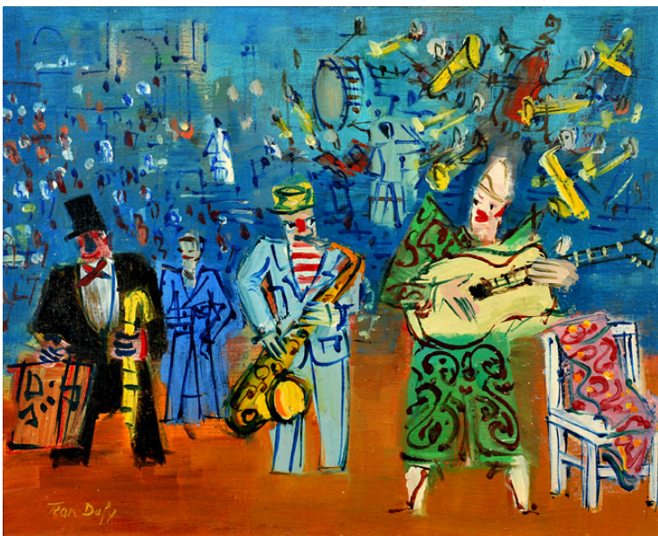
Jean Dufy, "Les Clowns et Musiciens," oil on canvas laid on Masonite, 14 by 12 by 18 inches.